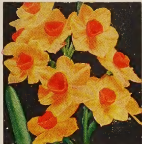
SOLEIL D'OR NARCISSUS

A Well-blended Mixture. A splendid strain containing a large number of beautiful colors. 65c per doz.; $4.50 per 100.